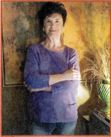
Exhibit Open Weekends, April 6 th to May 12 th Meet the Artist Reception Friday, April 12th 7-9pm