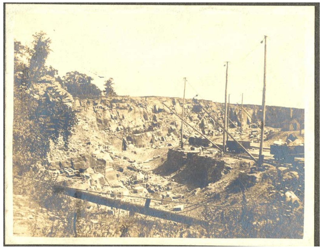
Penna RR Stockton circa 1903

The Prallsville Mills complex in Stockton, NJ, is considered a significant example of early American industrial architecture that was included on the National Register of Historic Places in 1973. Today, the Mill proudly features cultural and historic events for the entire community. You can find the Mills online at <a href="https://www.prallsvillemills.org">www.prallsvillemills.org</a>.