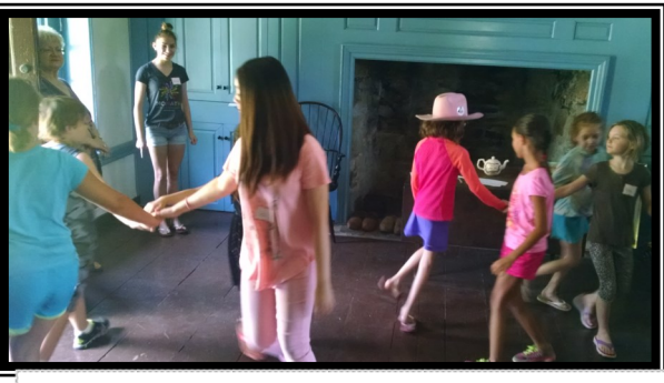
Left –candle dipping; Above—English county dance